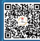
Huawei Certification Website