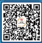
Huawei Certification Facebook

Huawei Certification email: certification@huawei.com