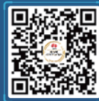
Huawei Certification Twitter