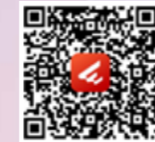
HUAWEI eKit APP

Agile processing and efficient operation